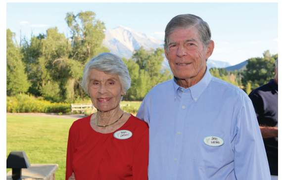
Valley View Foundation donors at 2023 Summit Circle Reception