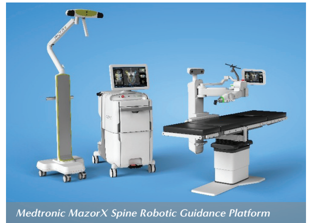
Medtronic MazorX Spine Robotic Guidance Platform