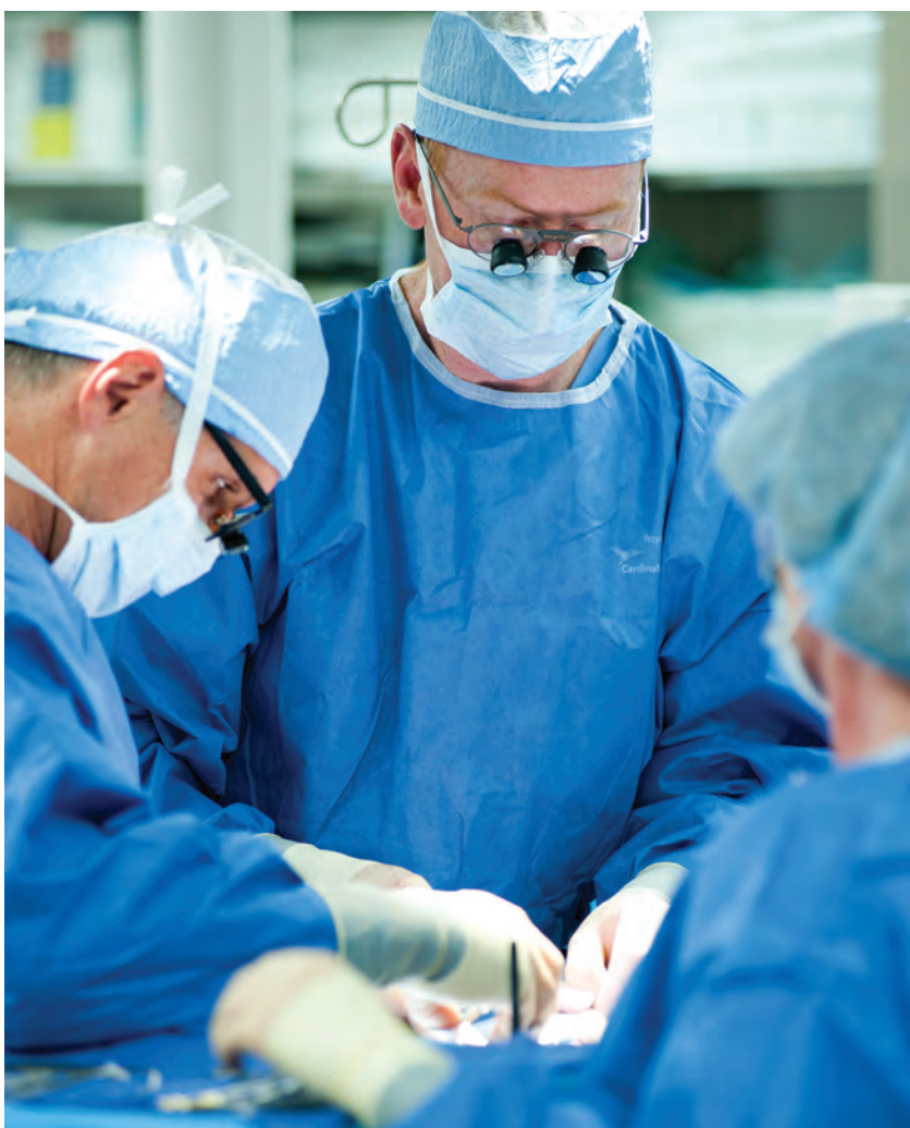
4,199 surgeries and procedures