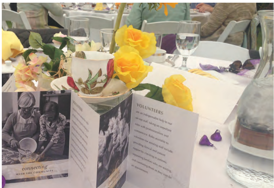
{\it Elegant Tea} \\ {\it Fundraiser for medical education}

The Valley View Hospital Auxiliary has been in existence since the hospital opened in 1955.