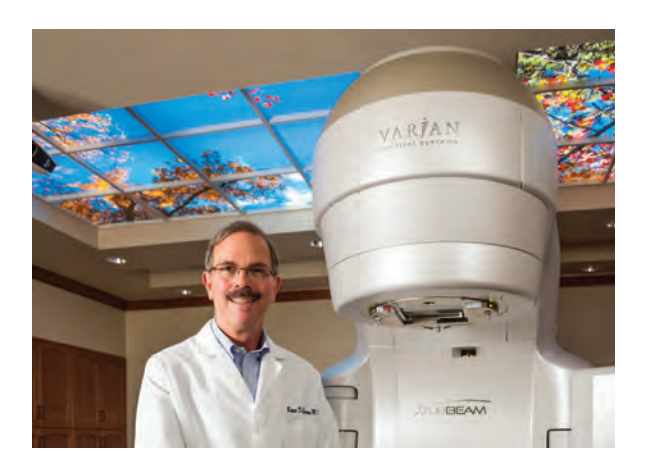
13,379 radiation oncology procedures