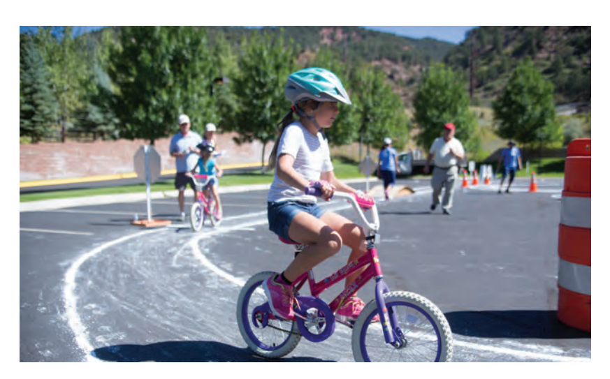
Kids and Teens Safety Fair