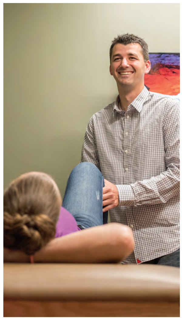
PeopleCare. That's Valley View.