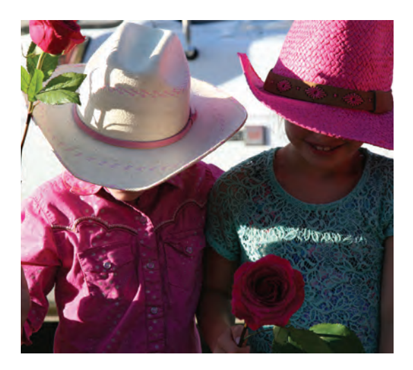
Tough Enough to Wear Pink Rodeo