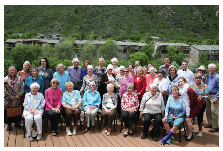
Volunteer appreciation luncheon

Valley View Volunteers are a compassionate and dedicated group of individuals that contribute their time, talents and energy to the health and well-being of our community. Volunteers play a key role in the healing presence and culture of our hospital.