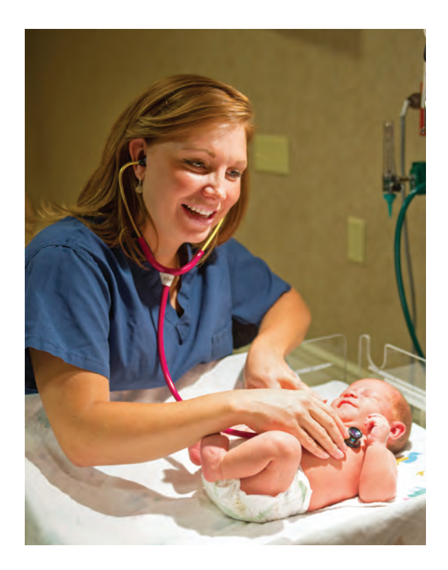
769 babies born