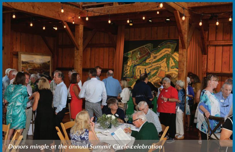
Donors mingle at the annual Summit Circle celebration

*Names with asterisks signify 2021 Valley View employee donors.